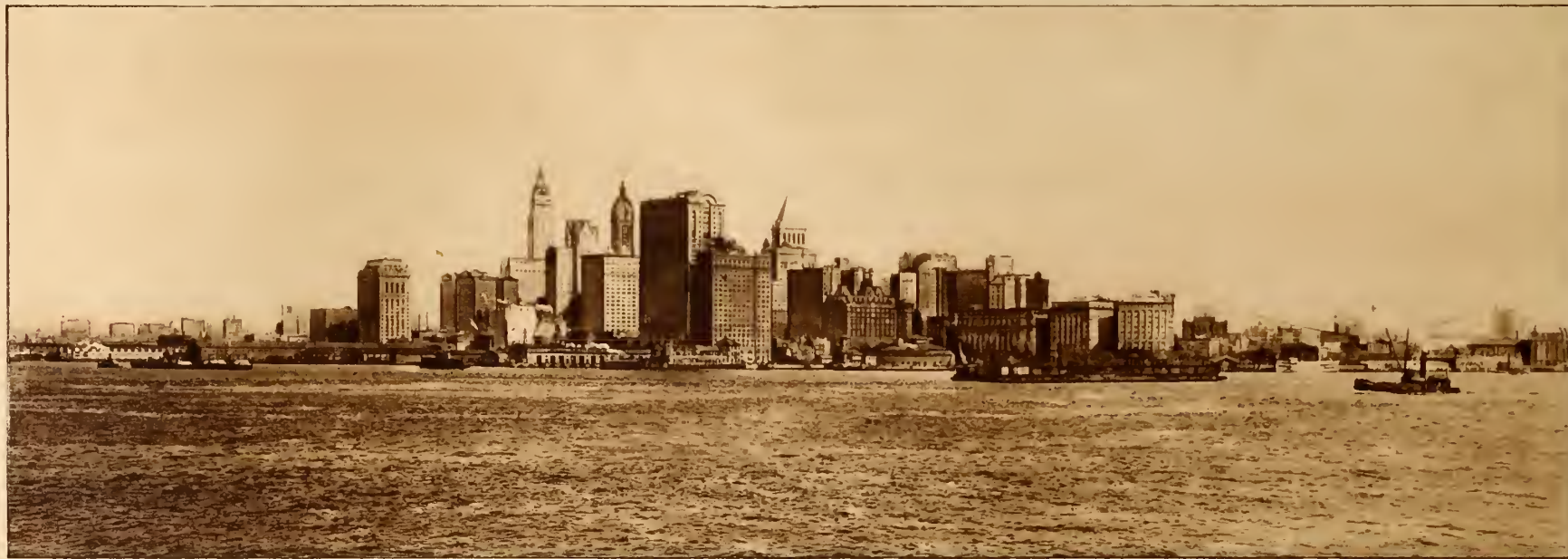
BIRD'S-EYE VIEW OF NEW YORK AS SEEN FROM THE STATUE OF LIBERTY. It is worth while to visit the Statue to obtain this wonderful view of the world's largest city.